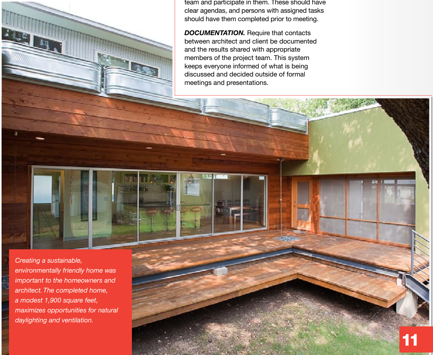
Creating a sustainable, environmentally friendly home was important to the homeowners and architect. The completed home, a modest 1,900 square feet, maximizes opportunities for natural daylighting and ventilation.

DOCUMENTATION. Require that contacts between architect and client be documented and the results shared with appropriate members of the project team. This system keeps everyone informed of what is being discussed and decided outside of formal meetings and presentations.